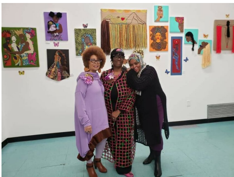
'From Womb to Womanhood' through March 31 (/stories/from-womb-to-womanhood-through-march-31,31651)