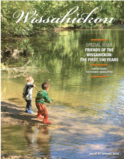
Mar 28, 2024 issue (/stories/mar-28-2024-issue,31652)