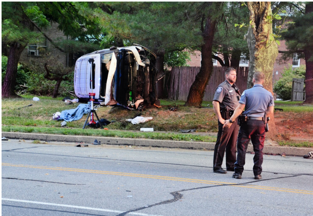
( https://alpha.creativecirclecdn.com/chestnuthilllocal/original/20240820-204029-d93-accident.jpg )

Grassroots group emerges to address neighborhood growing pains