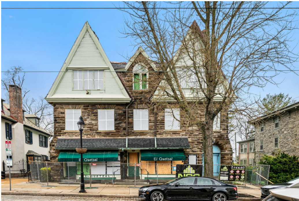
( https://beta.creativecirclecdn.com/chestnuthilllocal/original/20240416-195340-Hiram%20Lodge%20listing.jpg )

Hiram Lodge, located at 8425 Germantown Ave., is listed for sale at $1.4 million.