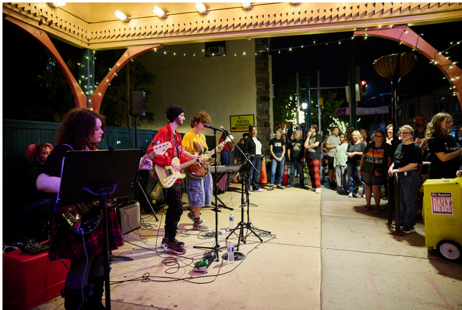
( https://alpha.creativecirclecdn.com/chestnuthilllocal/original/20240924-232316-33a-YEE_9336-20231006%20%281%29.jpg )

The Crefeld School's Glee Club and student musicians, who performed a mix of covers and original music at last year's Night of Lights, will be stationed next to the Flip the Switch opening ceremony again this year.