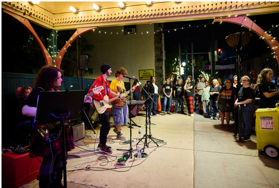
( https://alpha.creativecirclecdn.com/chestnuthilllocal/original/20240924-232316-33a-YEE_9336-20231006%20%281%29.jpg )

The Crefeld School's Glee Club and student musicians, who performed a mix of covers and original music at last year's Night of Lights, will be stationed next to the Flip the Switch opening ceremony again this year.