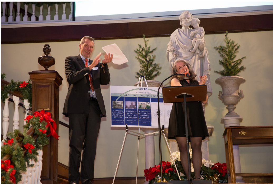
( https://alpha.creativecirclecdn.com/chestnuthilllocal/original/20241121-014604-edf-2018-12-01%20CHC%20Gala-84.jpg )

The inaugural event honors outstanding achievements in preservation and innovation.