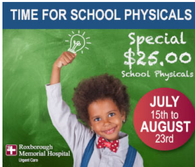
( https://chlbanners.creativecirclemedia.com/www/delivery/cl.php?bannerid=878&zoneid=1&sig=600fe88396962f4f5f9144271c03e566bc380ce6ed7838c98ca883e8ecb84922&oadest=https%3A%2F%2Froxboroughmemorial.com%2Four-services%2Furgent-care%2F )