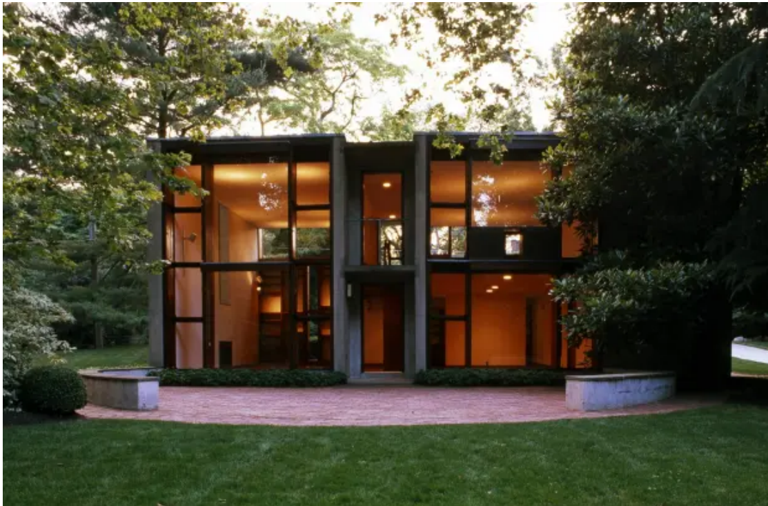
Esherick House

During this illustrated lecture, Rybczynski will discuss and compare three Chestnut Hill homes well-known to those interested in modern architecture – the Vanna Venturi House, the Margaret Esherick House, and the Dorothy Shipley White House – as seen through the lens of their architects' intentions. Rybczynski "found the creative combination of three interesting houses, three talented architects, and three adventurous women to be irresistible."