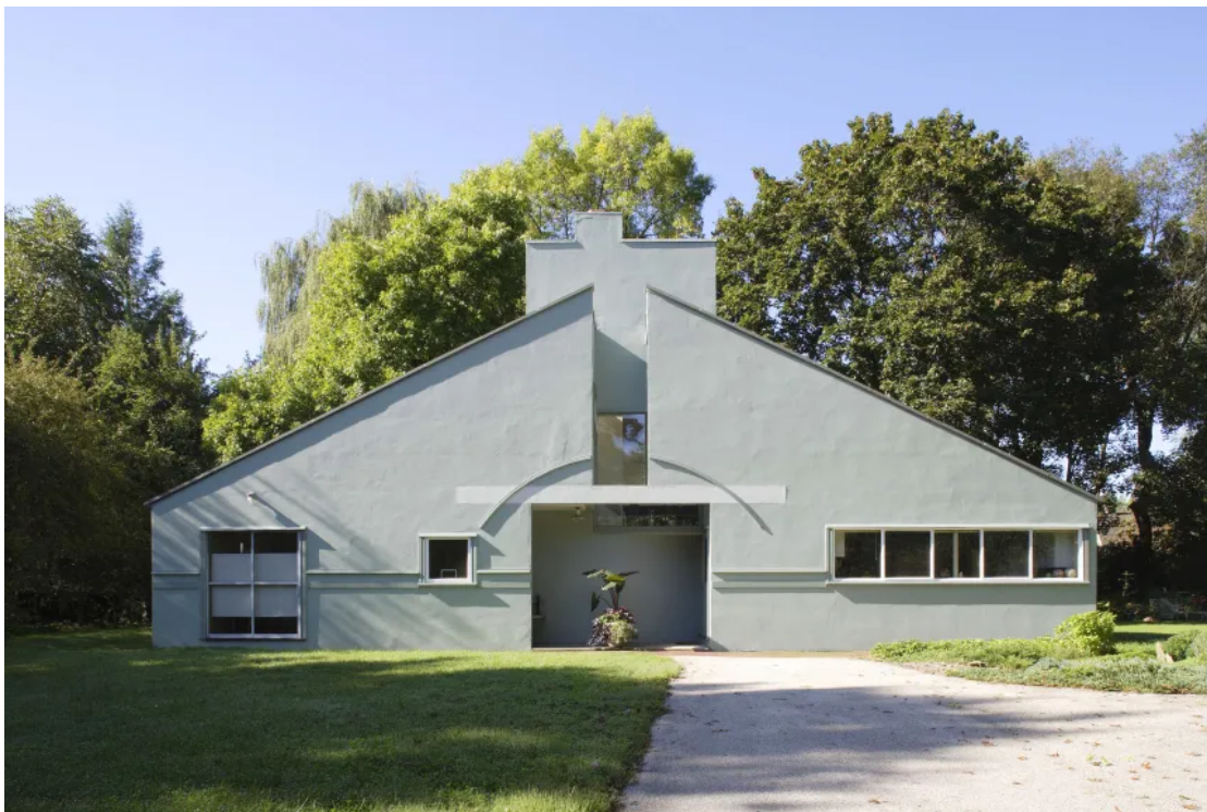
Vanna Venturi House