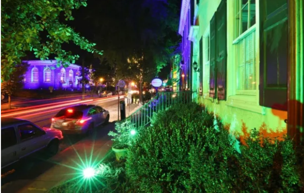
Germantown Avenue is aglow during a prior Night of Light celebration.

Sponsors include the Chestnut Hill Hotel, Chubb, George Woodward Co., MIS Capital, The Sivel Group, Unique Indoor Comfort, Elfant Wissahickon Realtor, Johnson, Kendall & Johnson, Inc., and Robertson's Florist. Night of Lights is also possible through the support and partnership of many local businesses, including the Chestnut Hill Business District, and is part of DesignPhiladelphia and Archives Month Philly.