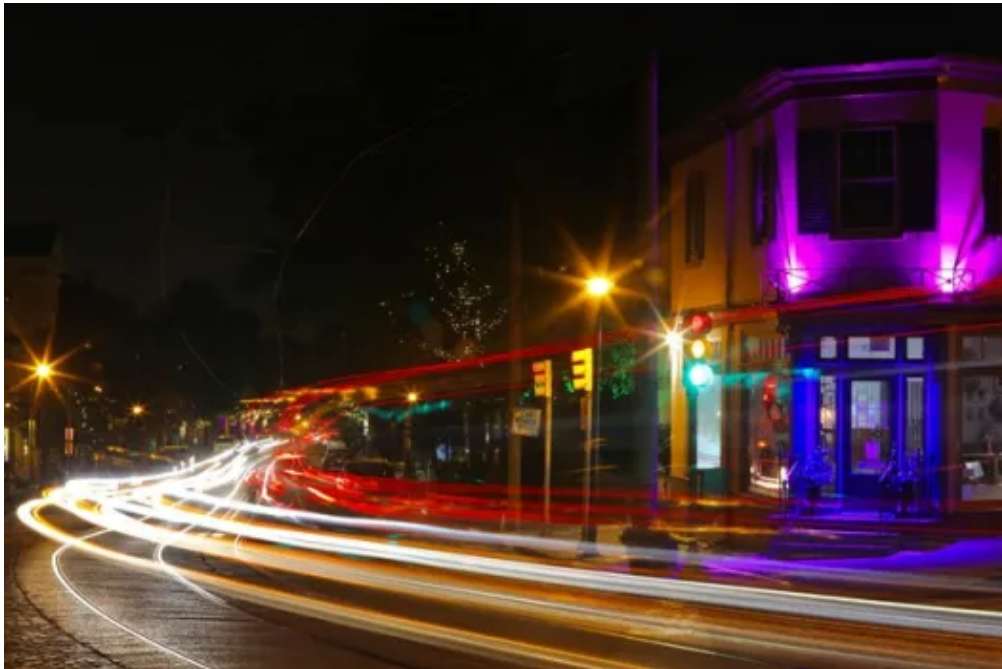
The Night of Light ambiance can be seen along Germantown Avenue.

Conservancy to light up Germantown Avenue and illuminate history with showcase of Chestnut Hill's archives and architecture