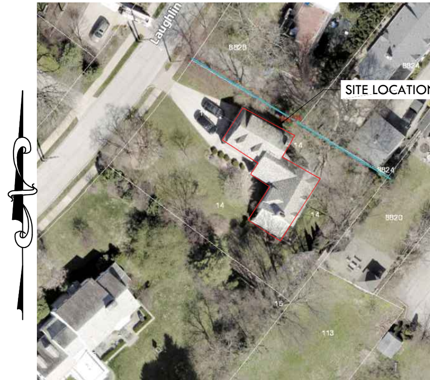
LOCATION AERIAL VIEW N. T. S.