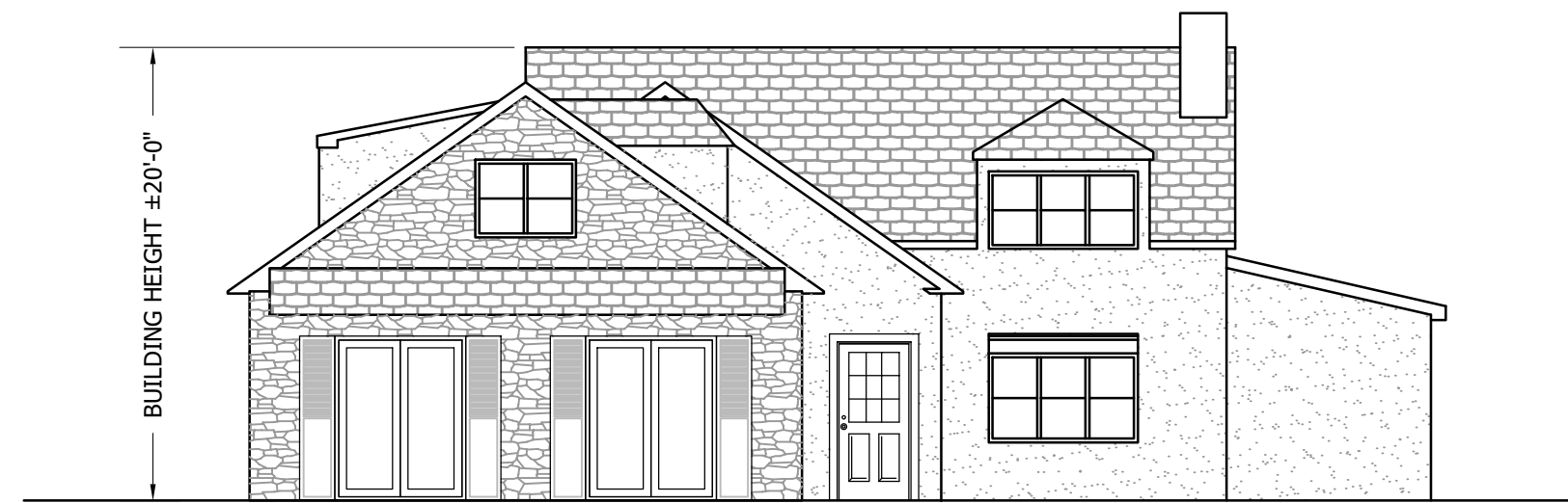
2 FRONT ELEVATION Z1 SCALE : 1/4" = 1' - 0"

INTENT: CLIENT INTENDS TO REMOVE WALLS DIVIDING THE EXISTING KITCHEN, DINING ROOM AND LIVING ROOM. THE KITCHEN WILL THEN EXPAND INTO THE EXISTING DINING ROOM AND THERE WILL BE ADDITION TO THE SOUTH EAST OF THE PROPERTY FROM THE EXISTING DINING ROOM.