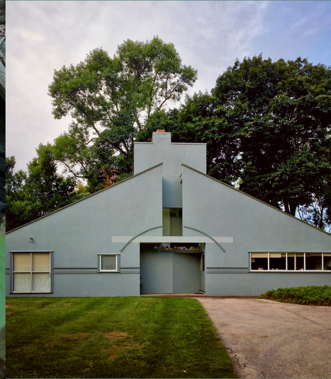
Above: Vanna Venturi House.

Chestnut Hill Conservancy is an educational center and leading advocate for the architecture, open space, and history of Chestnut Hill and surrounding communities in the Wissahickon watershed.