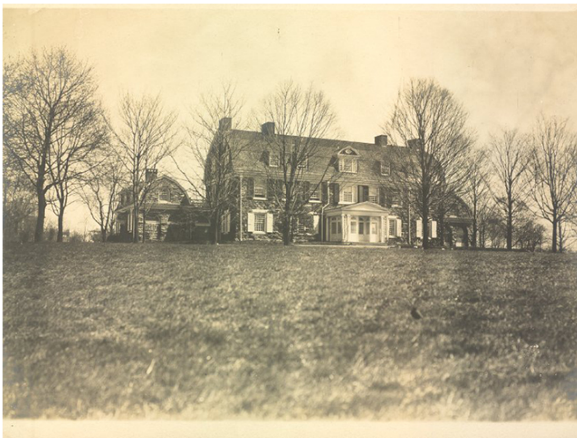
Keewaydin photographed in 1905.

Posted on March 13, 2020 ( https://www.chestnuthilllocal.com/2020/03/13/conservancy-efforts-add-keewaydin-estate-philadelphia-register-of-historic-places/ ), updated on March 13, 2020 ( https://www.chestnuthilllocal.com/2020/03/13/conservancy-efforts-add-keewaydin-estate-philadelphia-register-of-historic-places/ ) by Pete Mazzaccaro ( https://www.chestnuthilllocal.com/author/pete/ )