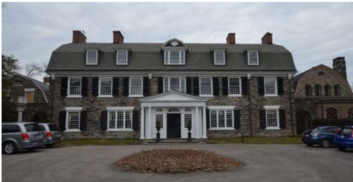
The main house of Keewaydin at 7709 Cherokee St.