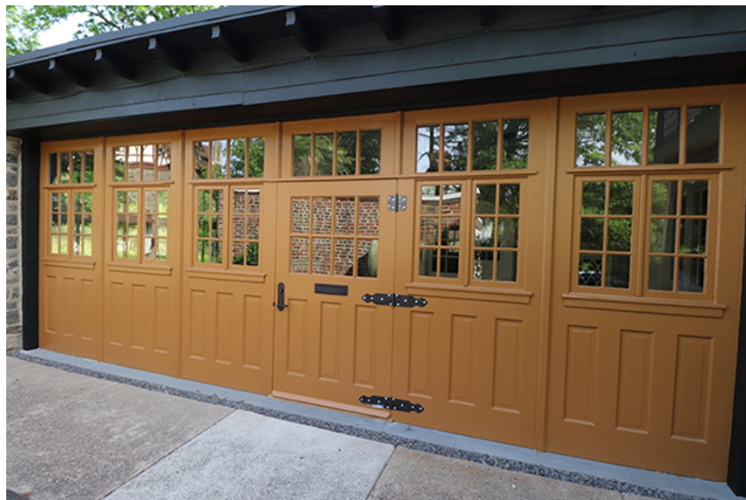
Restored carriage house doors at Fairelawn Manor in W. Mt. Airy

Our sixth year of awards became our first one to reach beyond Chestnut Hill to surrounding communities.