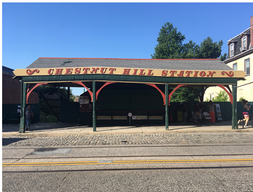
Chestnut Hill Station Trolley Canopy during restoration.

Posted on January 10, 2020 ( https://www.chestnuthilllocal.com/2020/01/10/discovering-chestnut-hill-two-winners-stories-from-the-chestnut-hill-conservancys-preservation-recognition-awards/ ), updated on January 10, 2020 ( https://www.chestnuthilllocal.com/2020/01/10/discovering-chestnut-hill-two-winners-stories-from-the-chestnut-hill-conservancys-preservation-recognition-awards/ ) by Contributor ( https://www.chestnuthilllocal.com/author/contributor/ )