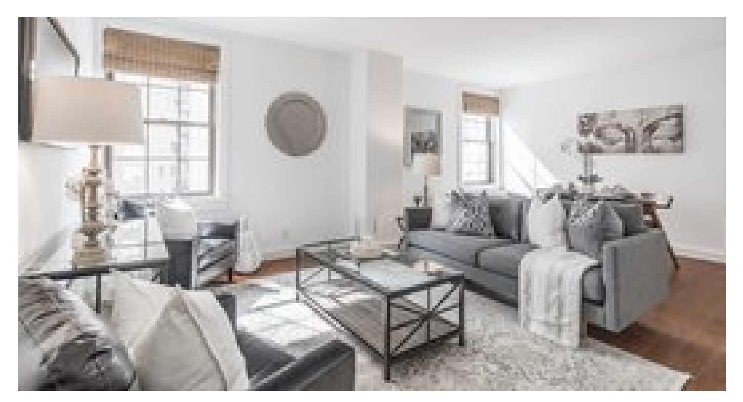
FOR SALE! Parc Rittenhouse - 2 bedroom, 2 bathroom with all rooms facing south, new hardwood floors, high-end kitchen finishes and marble appointed baths. 1,064 \text{ sf} \mid \$679,900