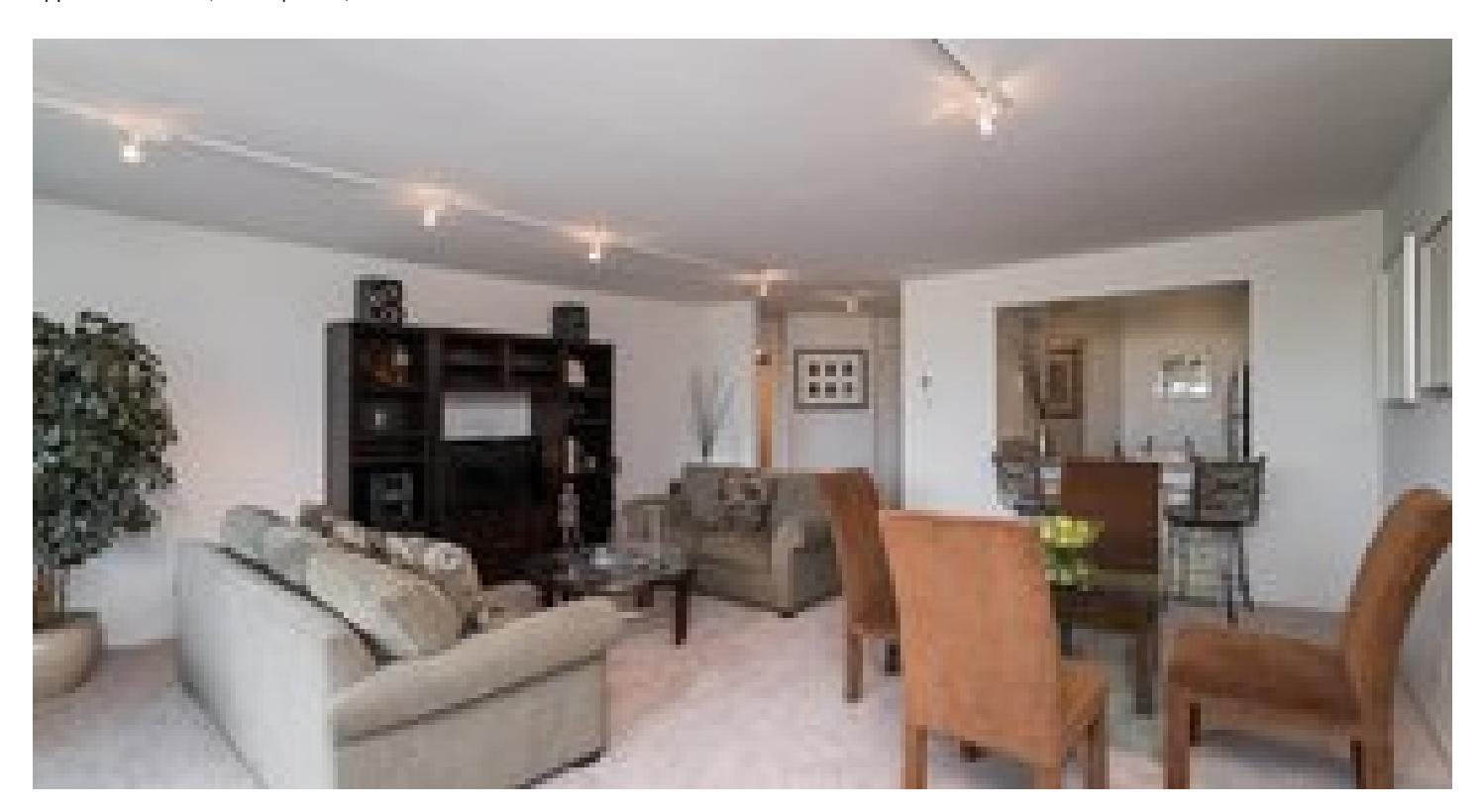
FOR SALE! The Philadelphian - Sun-soaked 1 bedroom with a private terrace boasting treetop views of Fairmount and a large, open floorplan. 1,005 sf | $249,900