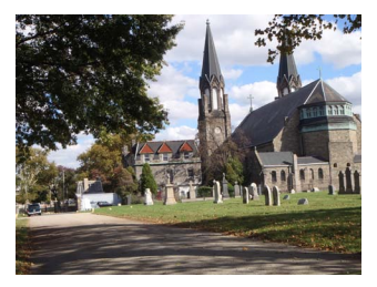
Old Cathedral Cemetery