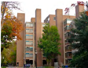
Alfred Newton Richards Medical Research Laboratories and David Goddard Laboratories Buildings, 3700-10 Hamilton Walk