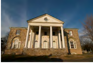
The Woodlands, 4000 Woodland Avenue

USW has four National Historic Landmarks, the highest level of federal historic designation: