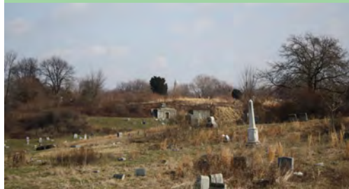
Section of the cemetery lacking maintenance

Mount Moriah Cemetery is one of the City's more prominent burial grounds. Its 142 acres of rolling hills, bisected by the Cobbs Creek and the Cobbs Creek Parkway, are situated in both the City of Philadelphia (77.3 acres) and the Borough of Yeadon in Delaware County (64.7 acres). The cemetery has fallen on hard times, both physically and financially. Invasive species have engulfed large sections of Mount Moriah, monuments have been desecrated, and the cemetery lacks a management entity with the capacity to ensure long term financial stability. This cemetery is an integral piece of Philadelphia's cultural history and, if programmed and managed properly, could serve as a major open space asset in Southwest Philadelphia, the inner ring suburbs of Delaware County, and the region as a whole. Some of the goals of the newly formed Friends of Mount Moriah are to promote preservation and passive recreation opportunities through community engagement.