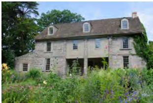
John Bartram House, 1650 S. 53rd Street