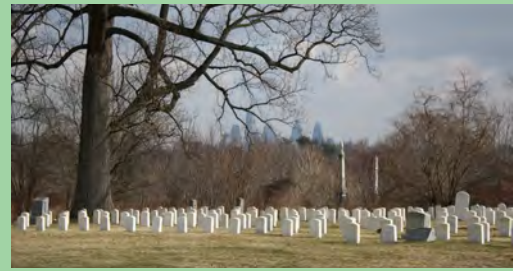
Maintained section of the cemetery