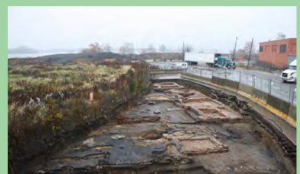
Top: Example of glass artifacts recovered from the project. Bottom: Example of Dyottville Glass Works excavations.