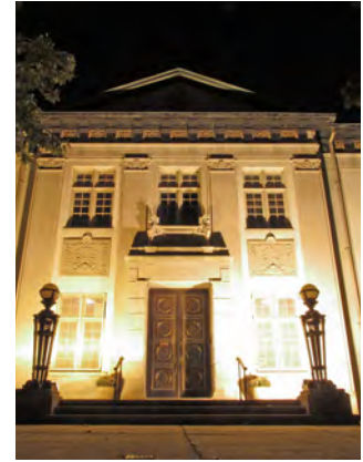
American Swedish Historical Museum, 2011