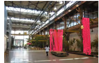
Urban Outfitters interior, 2011