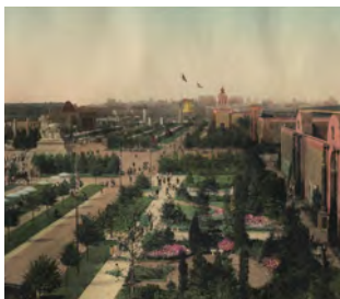
Looking toward the main entrance.