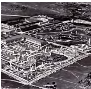
The exposition grounds covered about 1,000 acres.

Goal 8.1: Support sensitive development that preserves and enhances Philadelphia's multifaceted past.