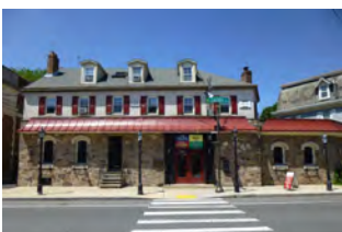
Hop Angel, 7980 Oxford Avenue In continuous operation since 1683 in this location