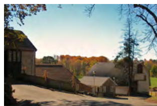
Fox Chase Farm, 8500 Pine Road