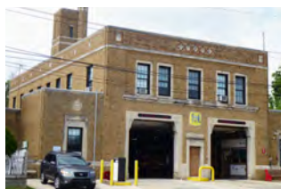
Engine 71 Fire Station, 1900 Cottman Avenue