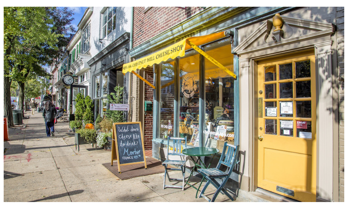
Green space and a village-like vibe together make Chestnut Hill distinctive among Philly neighborhoods. A panel discussion on April 21 will examine how it can maintain its distinctive character while accommodating growth and change.

BY SANDY SMITH | MARCH 10, 2017 AT 12:01 PM