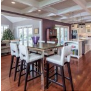
Jawdropper of the Week: New Old Money in Chestnut Hill for $1.945M