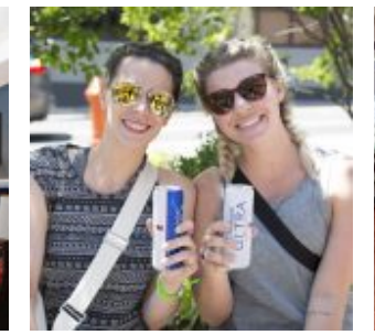
SPONSORED CONTENT Photos: Be Well Philly Boot Campers Toast Post-Workout Bods at Healthy Happy Hour with Michelob Ultra