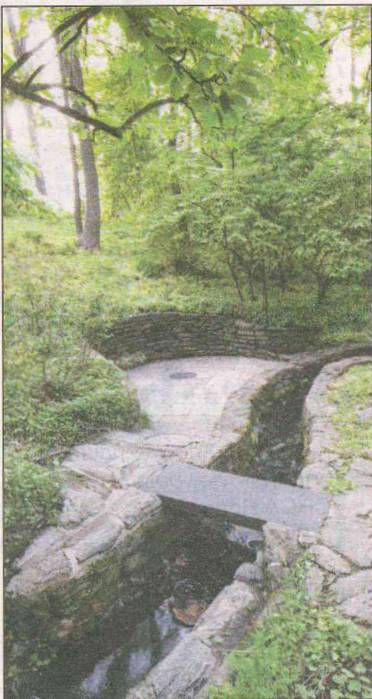
The Chestnut Hill Conservancy is dedicated to preserving and interpreting the Chestnut Hill area's heritage through an innovative easement program that preserves open space and historic facades in partnership with the Friends of the Wissahickon.