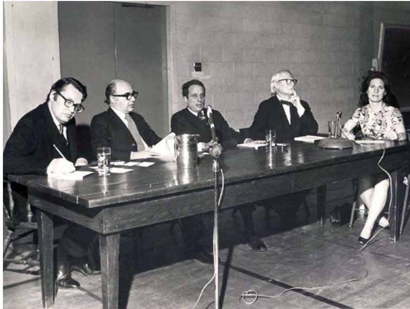
( http://www.chestnuthilllocal.com/wp-content/uploads/2017/04/Column_CHConserv.jpg )

Posted on April 14, 2017 ( http://www.chestnuthilllocal.com/2017/04/14/upcoming-event-recalls-legendary-architects-prescient-words-about-chestnut-hill-at-1970-panel-discussion/ ) by Contributor ( http://www.chestnuthilllocal.com/author/contributor/ )